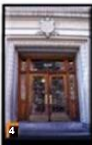
106 Haven Ave. Residence