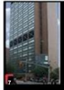
Hammer Health Sciences Ctr.