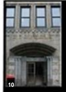
College of Physicians & Surgeons