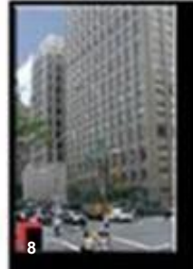
over William Black Research Building