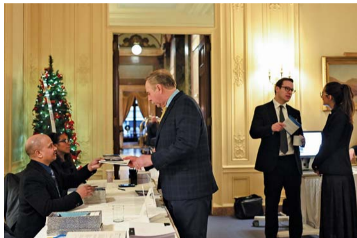
Attendee at check-in