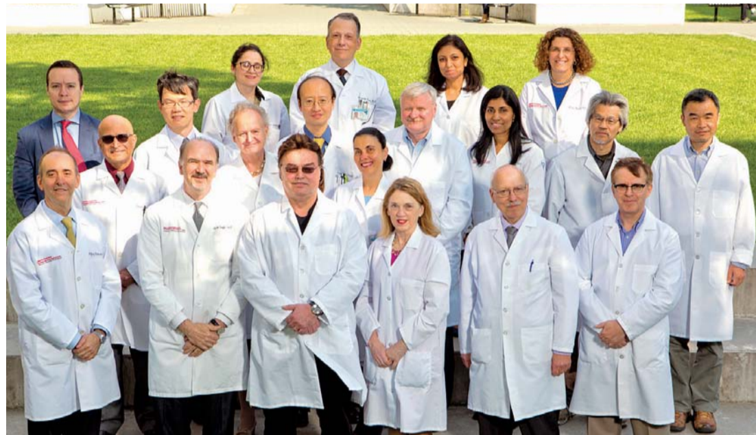
Basic Science Team